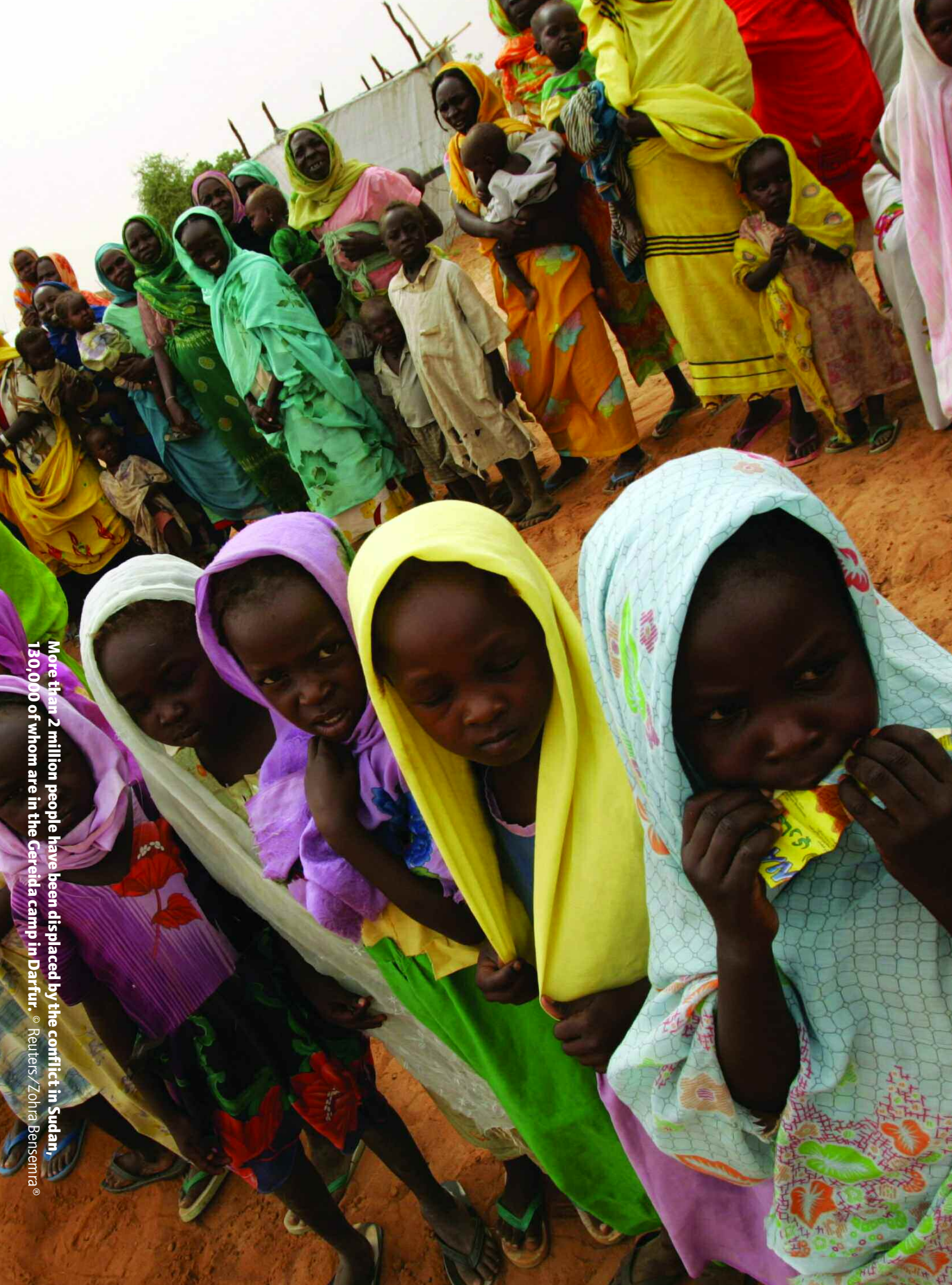
More than 2 million people have been displaced by the conflict in Sudan, 130,000 of whom are in the Cereida camp in Darfur.