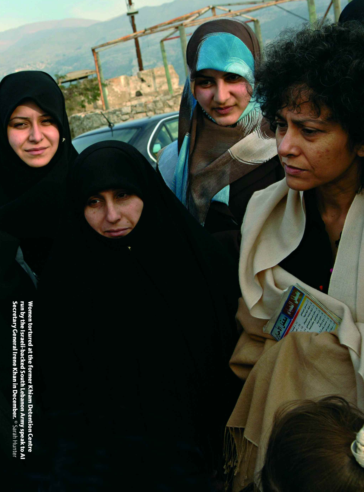
Women tortured at the former Khiam Detention Centre run by the Israeli-backed South Lebanon Army speak to AI Secretary General Irene Khan in December.