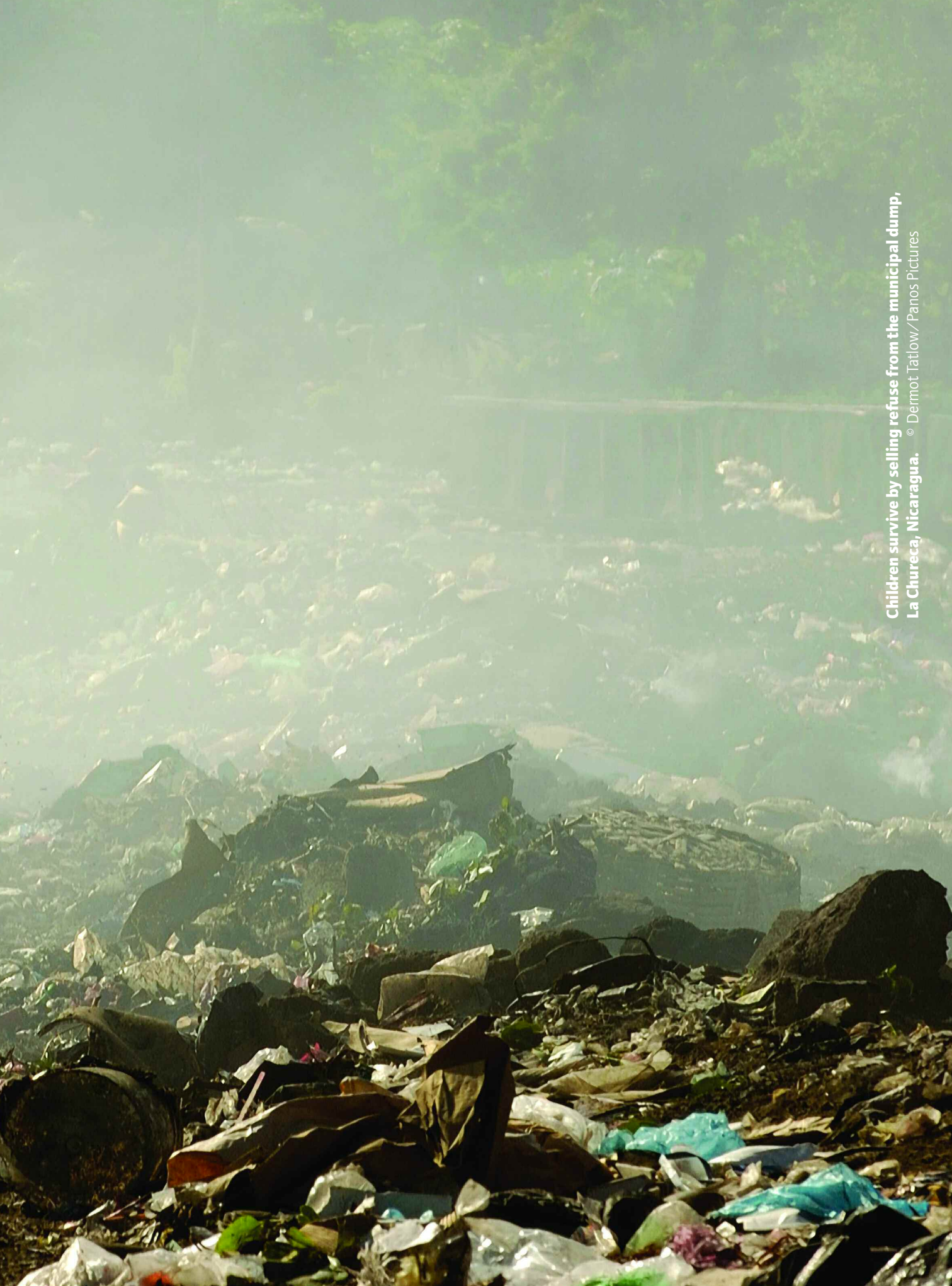
Children survive by selling refuse from the municipal dump, La Chureca, Nicaragua.