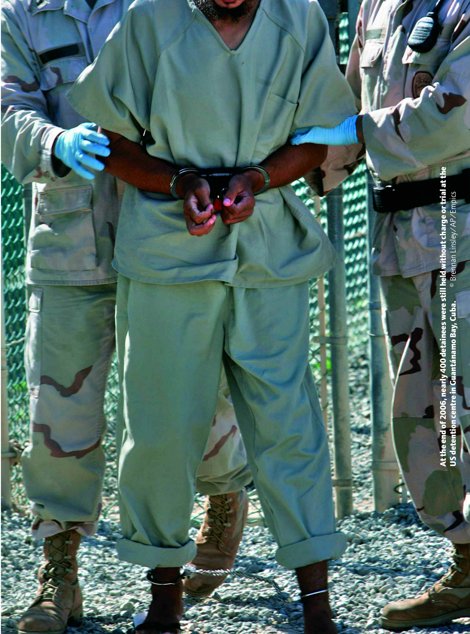
At the end of 2006, nearly 400 detainees were still held without charge or trial at the US detention centre in Guantánamo Bay, Cuba.